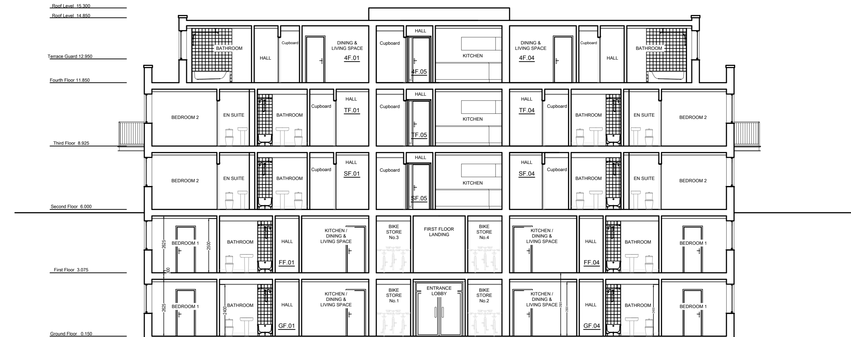
Proposed Cross Section A - A