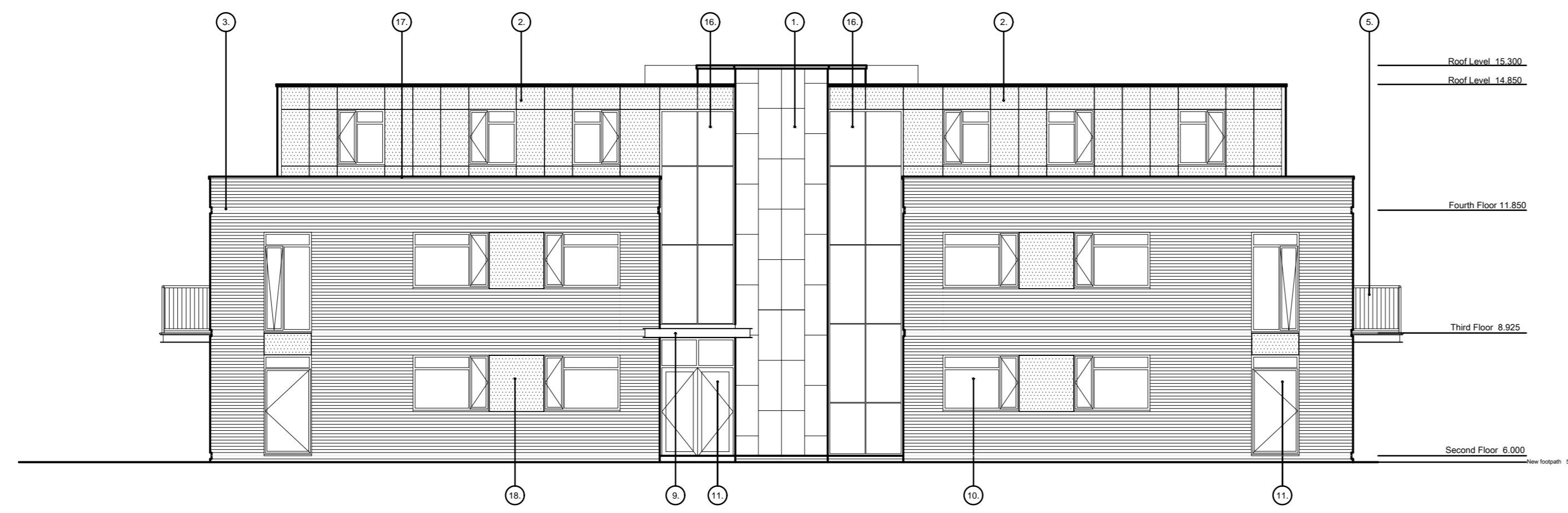
Rear Elevation Main Entrance from McLellan Place - Blocks S07 & S08 Main Entrance from Central P.O.S - Block N04