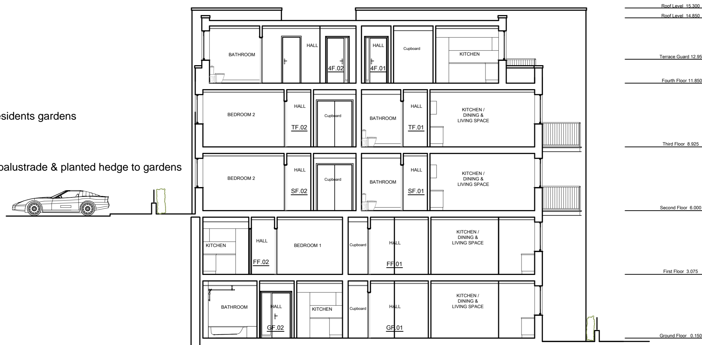
Proposed Cross Section B - B