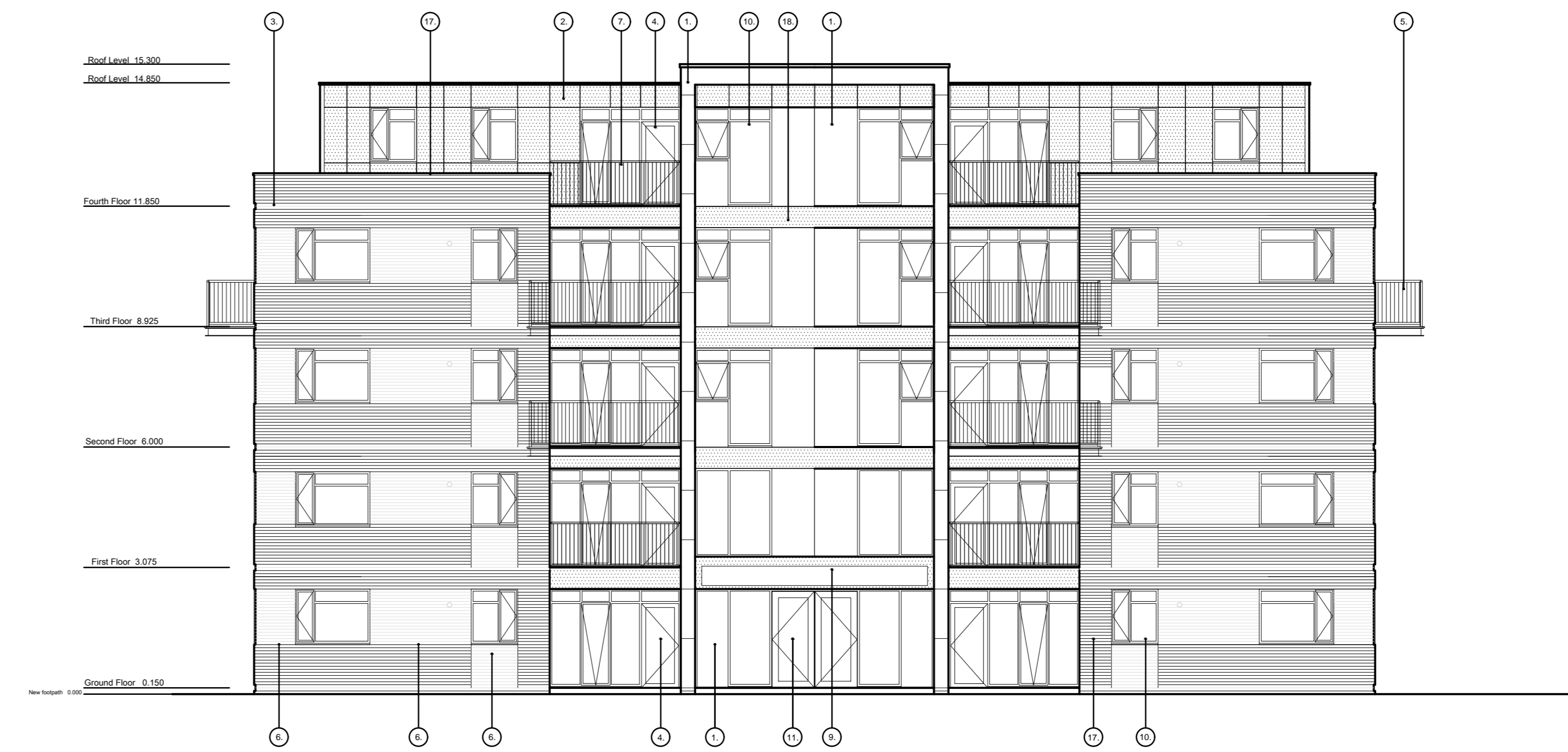
Front Elevation Main Entrance from McLellan Place - Blocks S07 & S08 Main Entrance from Central P.O.S - Block N04