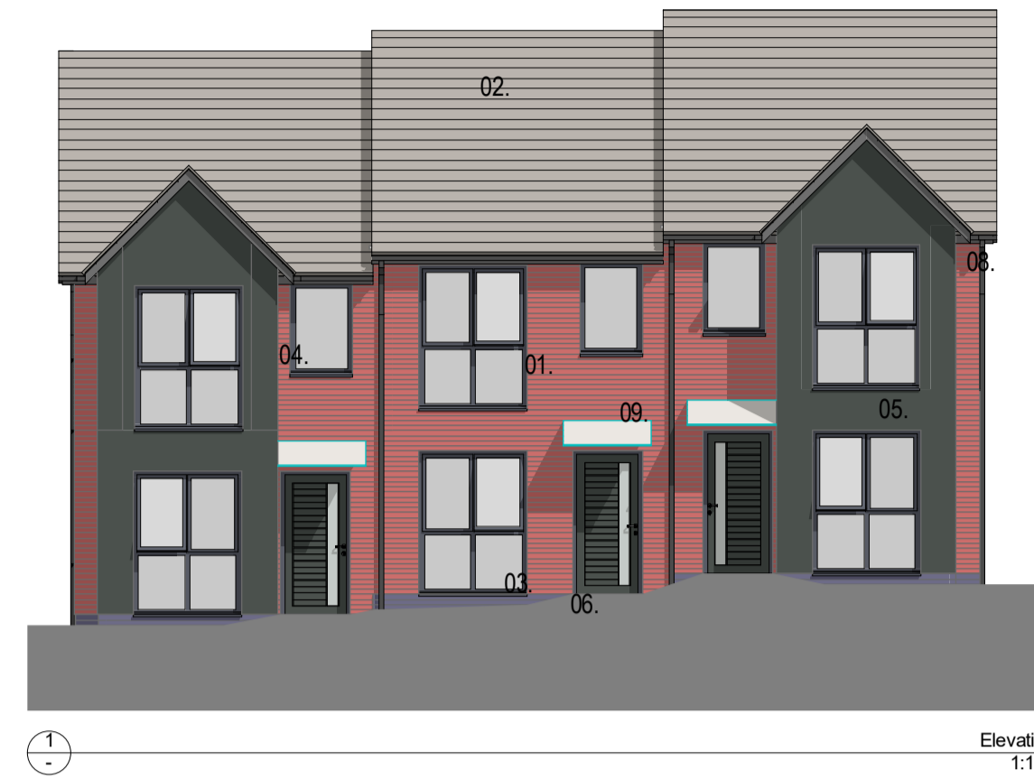
Elevation E-02 1:100