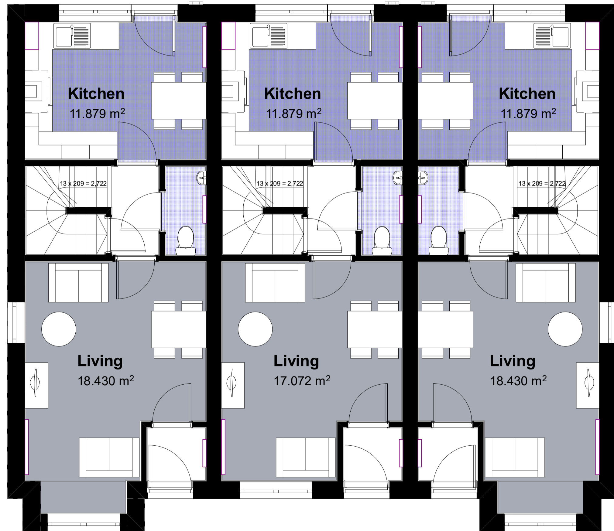
GROUND FLOOR PLAN - 1:50