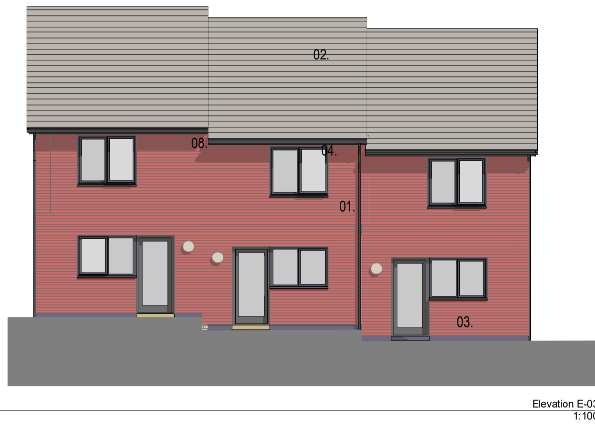
Elevation E-03 1:100