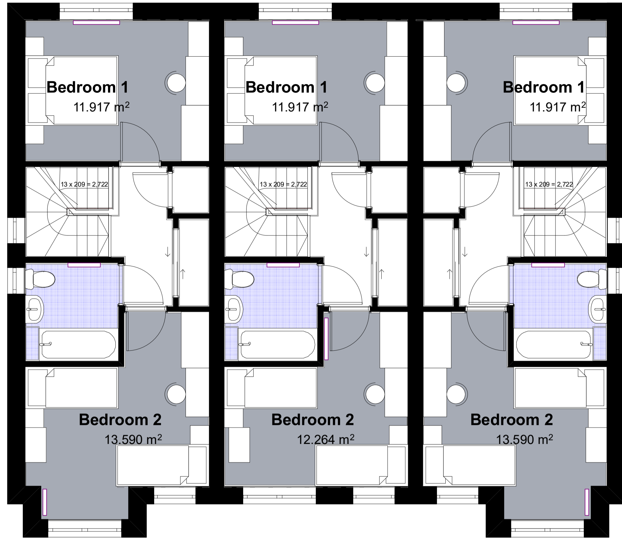
FIRST FLOOR PLAN - 1:50