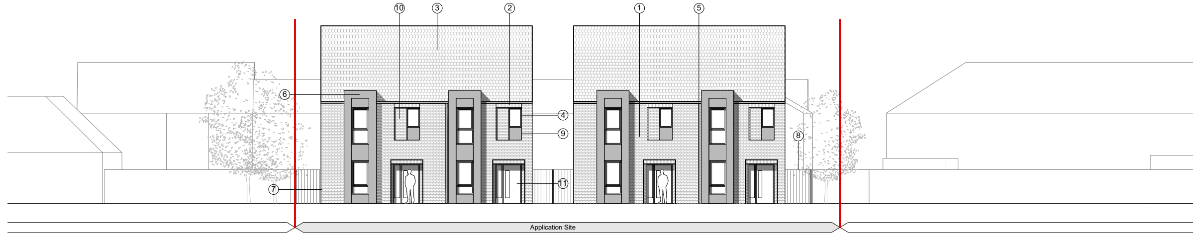
03 | Proposed Elevation CC Scale 1:200