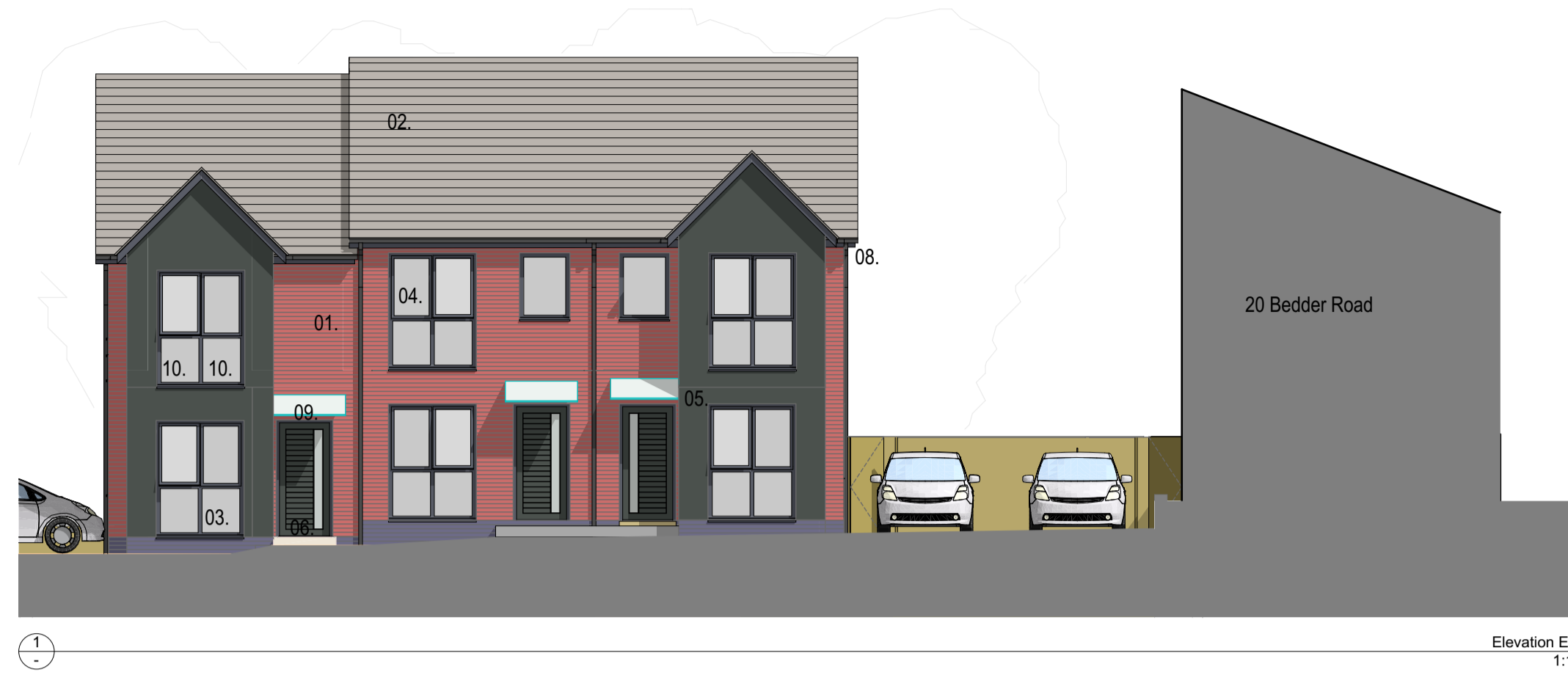
Elevation E-01 1:100