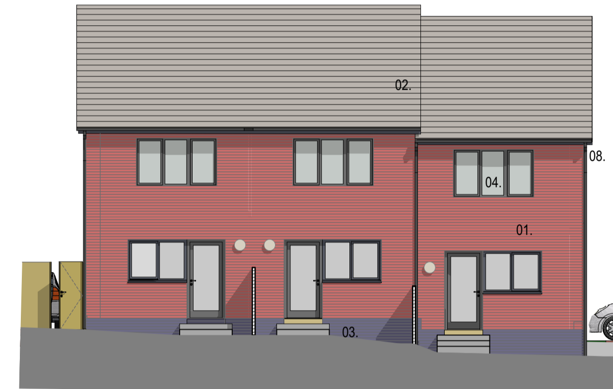
Elevation E-03 1:100