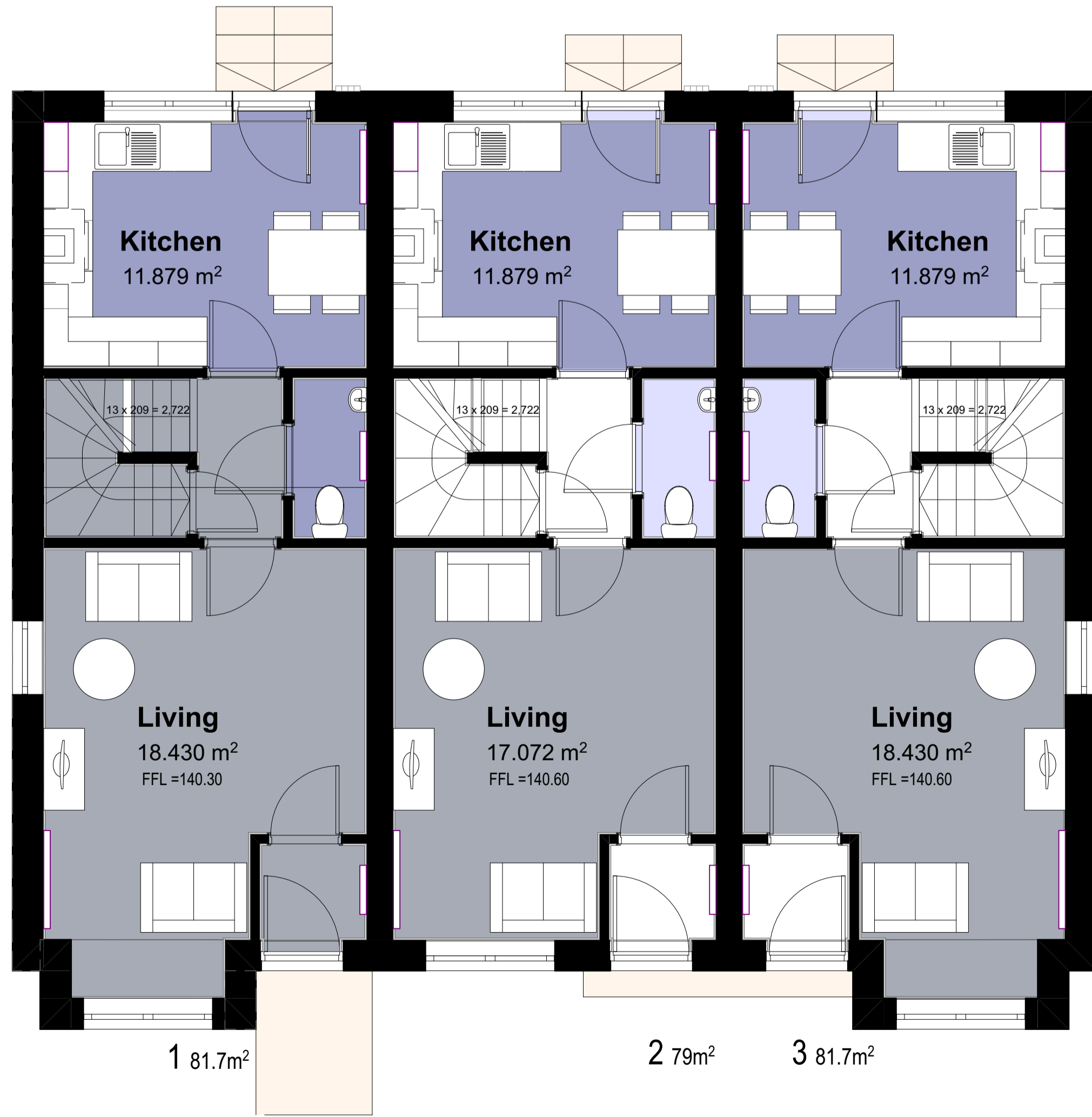
GROUND FLOOR PLAN - 1:50