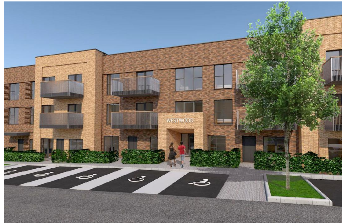
Image 6 - Main entrance