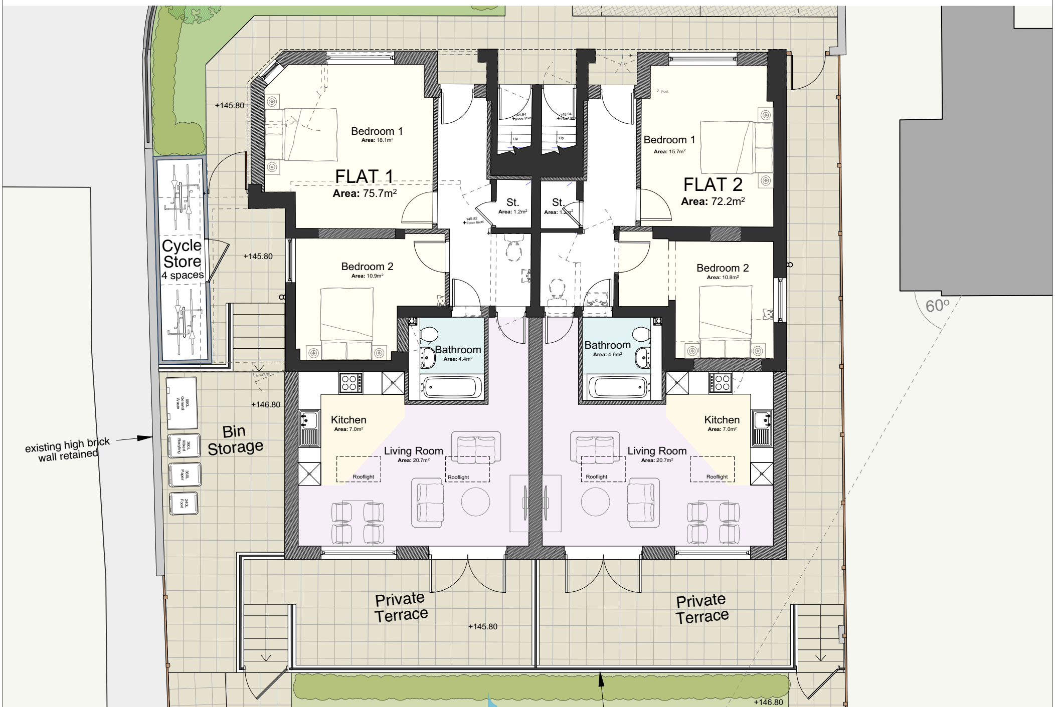
1 Proposed Ground Floor Plan Scale: 1:100