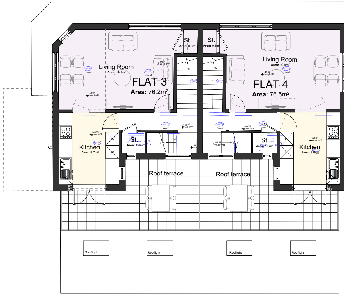
2 Proposed Ground Floor Plan Scale: 1:100