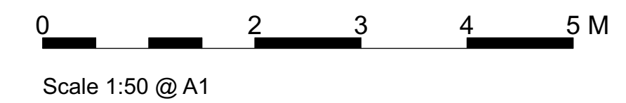
Scale 1:50 @A1