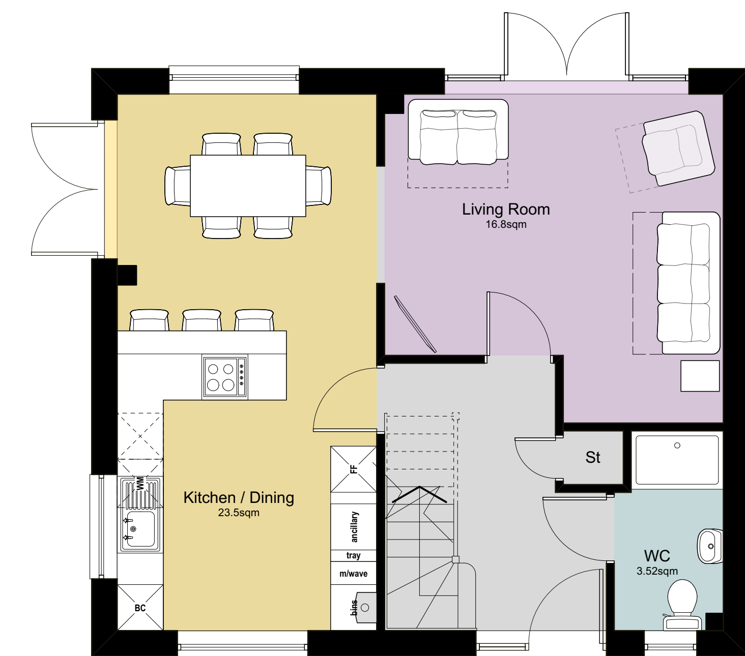
Scale 1:50 @A1