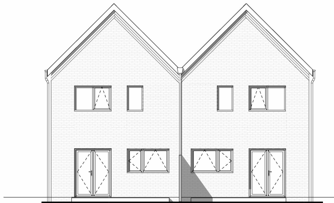
Rear Elevation (South) 1 : 100