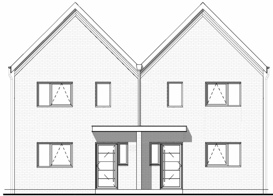
Front Elevation (North) 1 : 100