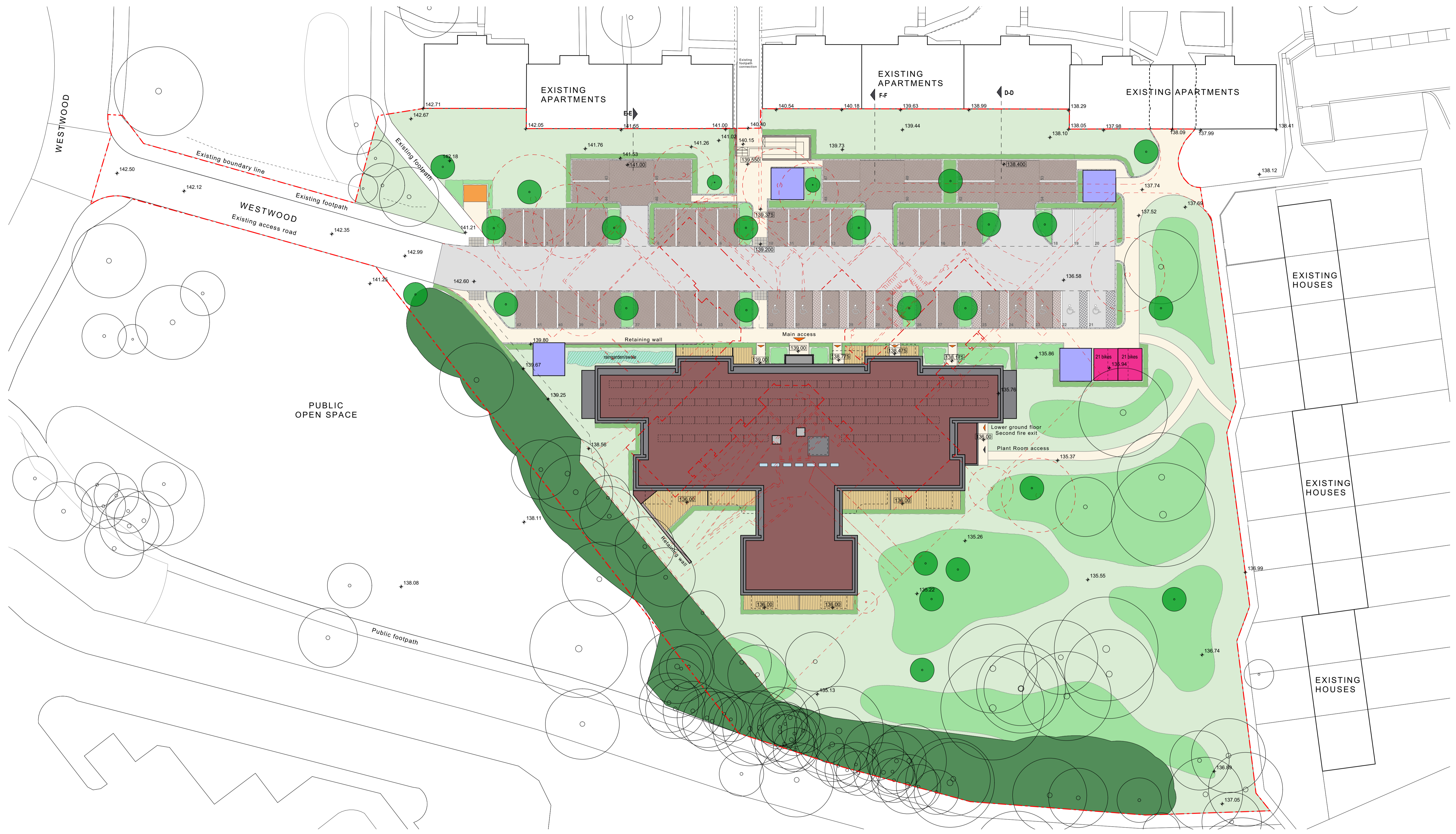
Proposed Site Plan 1:250