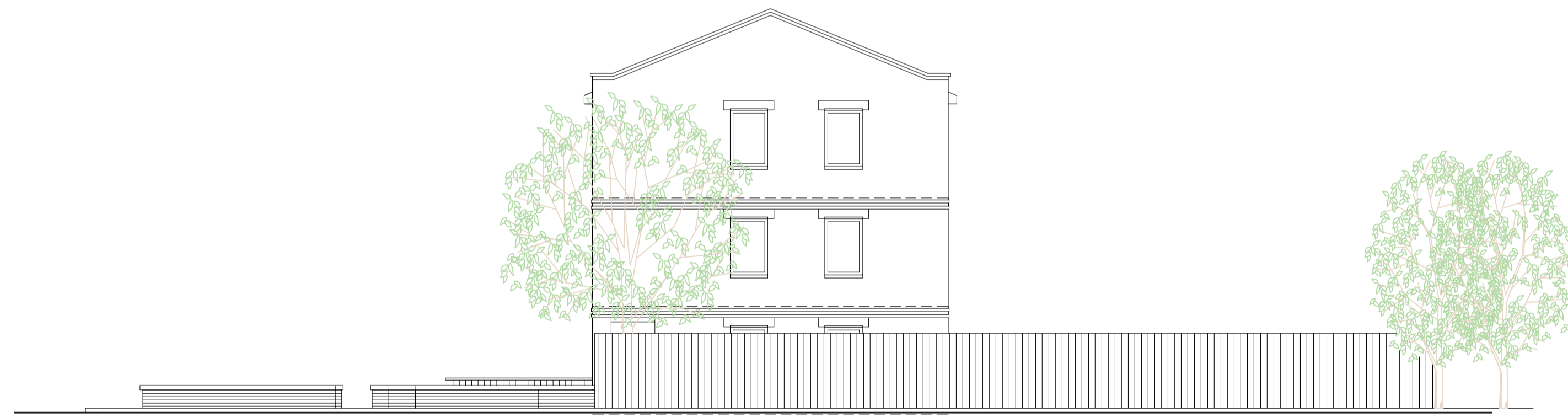
Context Elevation to George Road