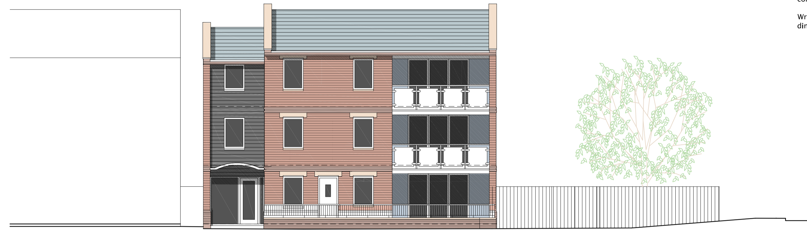
Elevation to Britnell Court