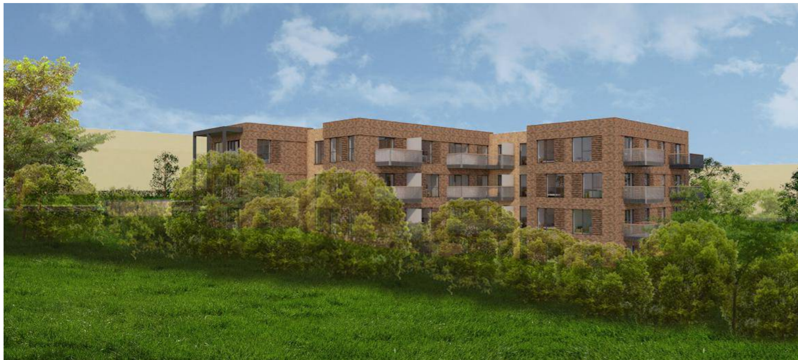
Image 3 - View from the public open space - West side