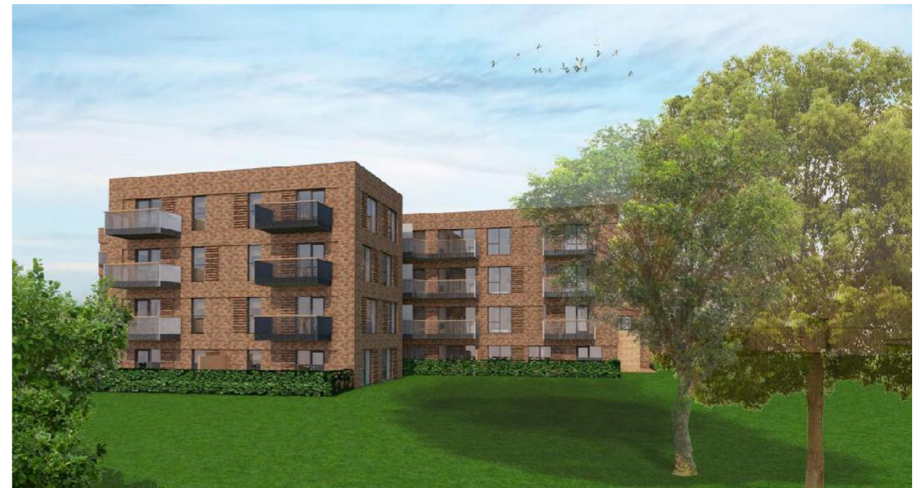
Image 4 - View from the north-east side