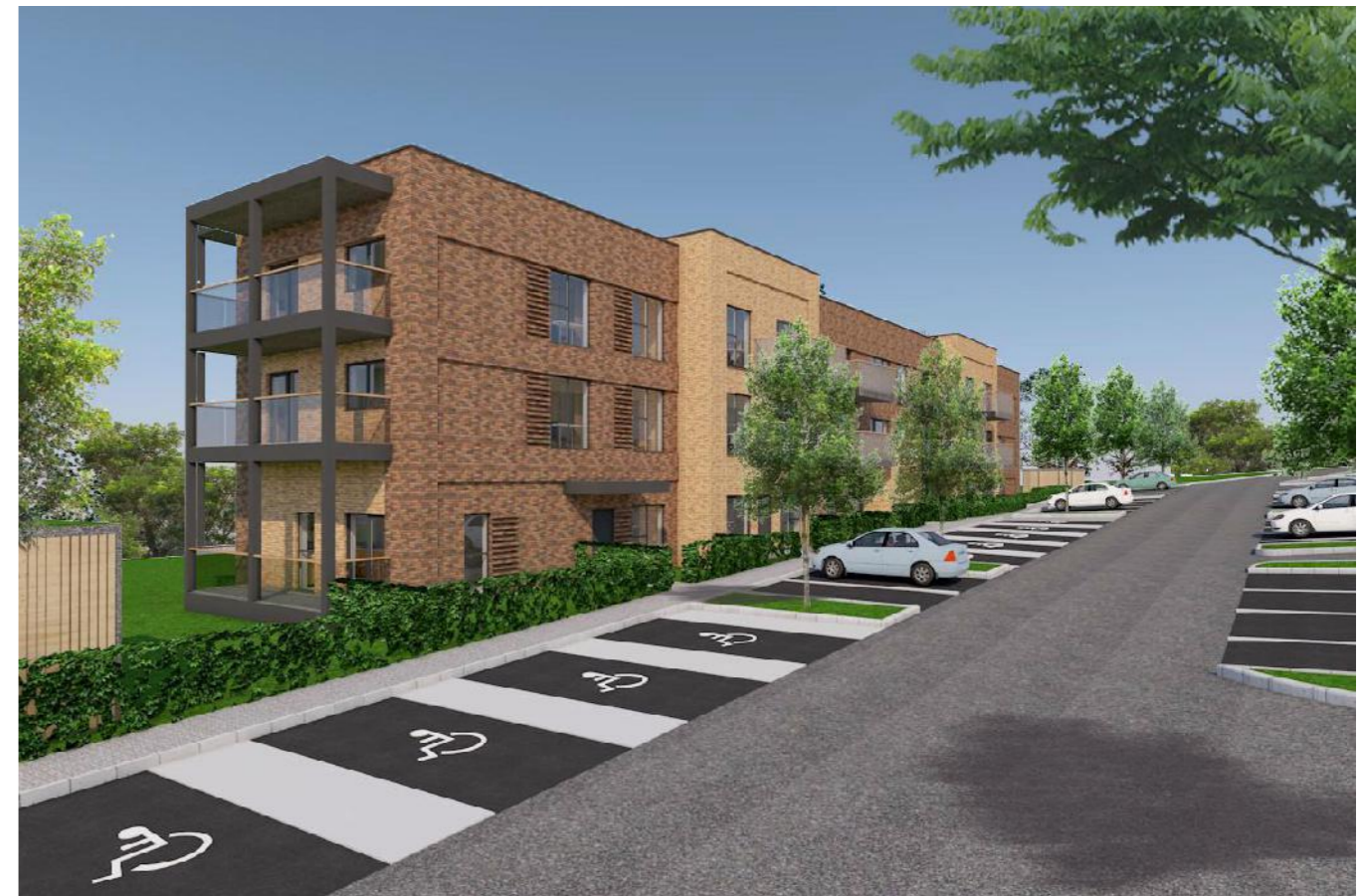
Image 5 - View from the north-east side