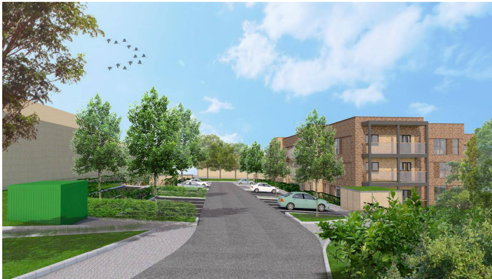
Image 2 - View from the main road